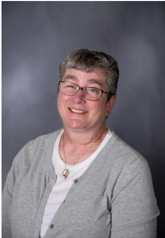
Sue Prins Library