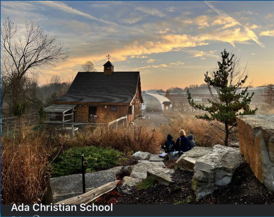
Ada Christian School