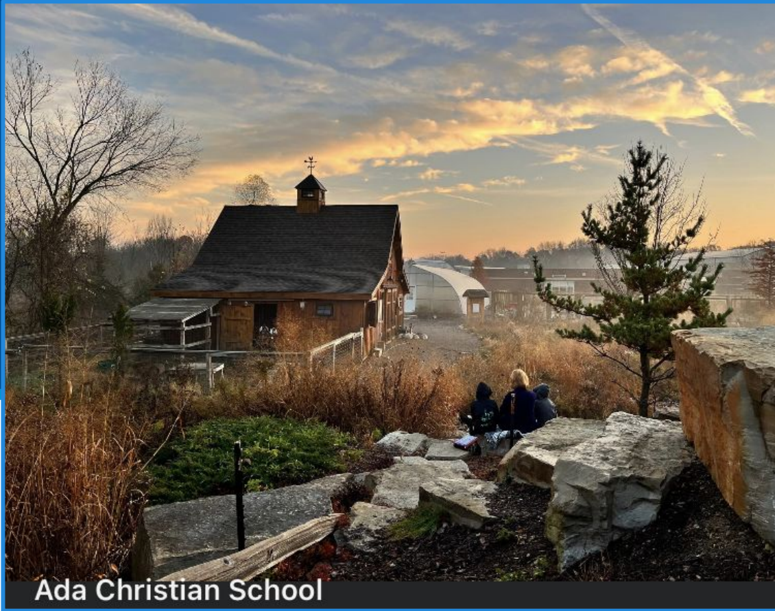
Ada Christian School