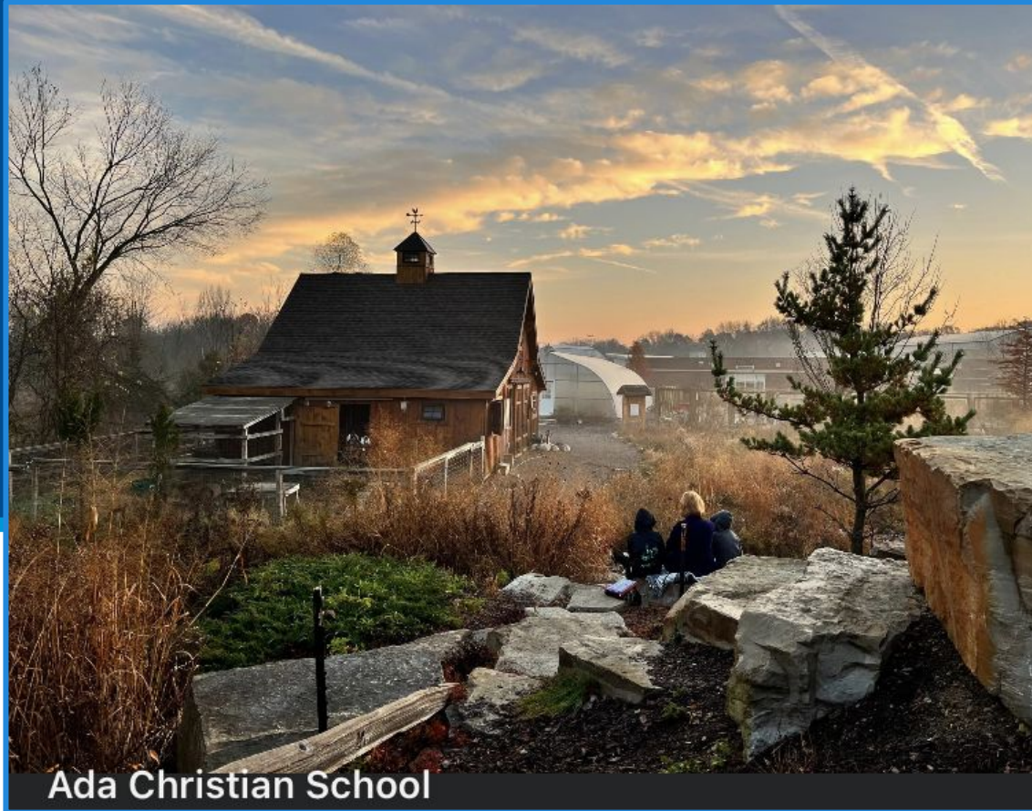
Ada Christian School