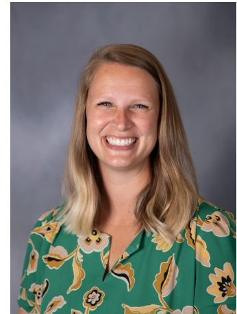
Hannah Phillips Kindergarten